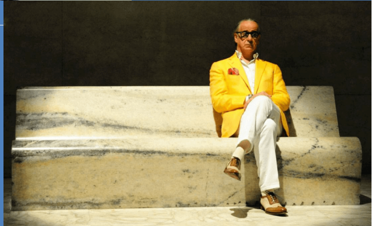
La grande bellezza (The Great Beauty, Paolo Sorrentino, 2012)

- Paolo Sorrentino, The Guardian Interview, 2016