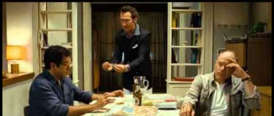
Posti in piedi in paradiso (A Flat for Three, Carlo Verdone, 2012)

- Carlo Verdone, Cineuropa Interview, 2012