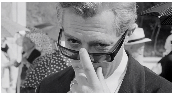
Otto e mezzo (8 1/2, Federico Fellini, 1963)

Schedule an appointment here: https://calendly.com/dolasinski/office-hours?