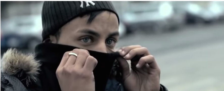
Ali a gli occhi azzurri (Ali Blue Eyes, Claudio Giovannesi, 2012)

“Being a man, I am much more critical of my own gender. Because women are a mystery to me, I tend to have positive projections onto them. Probably the fact that I don’t know the means I idealise them much more than I can with male characters.”