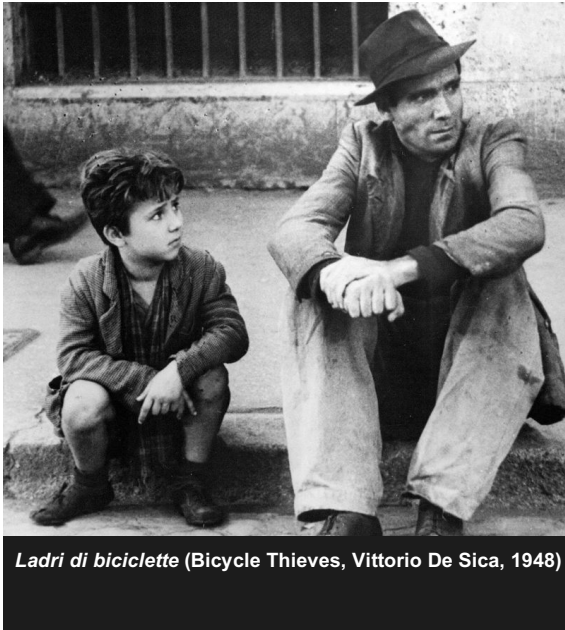
Ladri di biciclette (Bicycle Thieves, Vittorio De Sica, 1948)