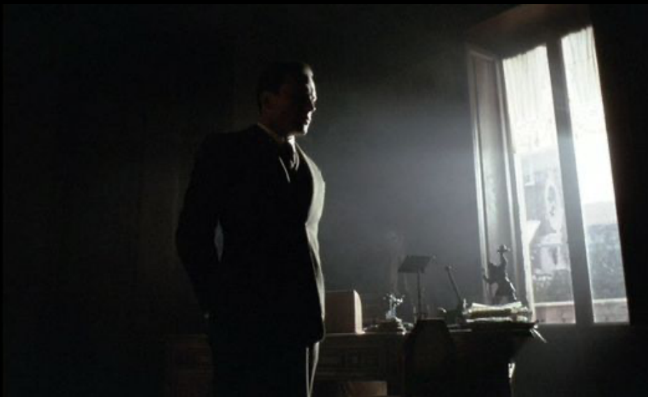
Il conformista (The Conformist, Bernardo Bertolucci, 1970)

Through the medium of film, we will explore the ways in which patriarchal family structures, fascism, and mafia culture have influenced, and continue to inform, dominant conceptions of masculinity in Italy. Masculinity will be treated as a performative construct, shaped by evolving socio-cultural and political concerns. The films screened will span several decades and cross multiple genres in order to trace the various ways mediated performances of masculinity sustain, destabilize, satirize, and/or revise stereotypes of Italian masculine identity (the Latin lover, the mafioso , the maschio italiano , and the mammone ). Students will deepen their knowledge of competing notions of masculinity through exposure to alternative ways of 'being a man'. We will focus primarily on male protagonists in 'crisis,' especially men who perform 'failing' masculinities: absent fathers, fallen patriarchs, 'feminized' men, impotent lovers, and isolated elders.